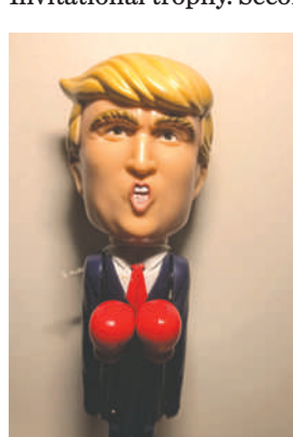
Win Slim Trump the Boxer on a Pen!

Winner gets the Clowning Achievement, our Style Invitational trophy. Second place receives a pen topped with a